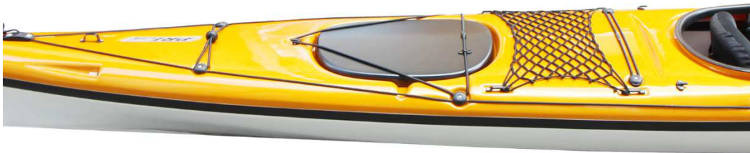
1 Anti-theft device